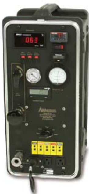
XC-40 Meter Console Recommended for Method 4 Testing